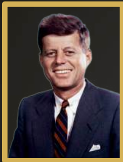
John F. Kennedy